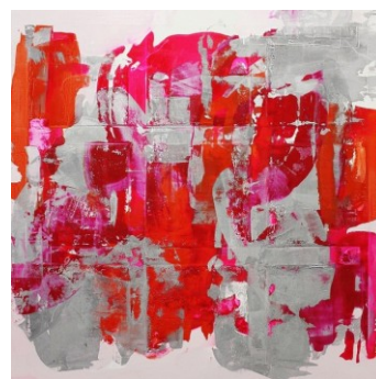
L: The Side Of The Back Of The Back Of The Correct Answer, 91x91cm, oil on canvas, 2015