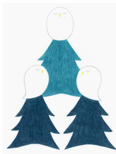
Monster Owl's Forest, 2019, 31×24cm, color pencil on paper