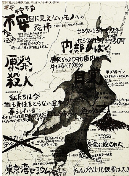
Be Conscious Of That Etching and lithograph 97×71cm 2014