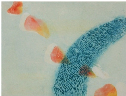
Rhythm Woodcut print on Japanese paper 90×52cm

Accumulating the forms which exist around me, and making myself.