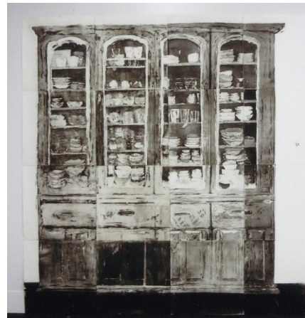
Cupboard Etching 200×200cm 2014

2014 39th National prints exhibition for art university students, museum purchased