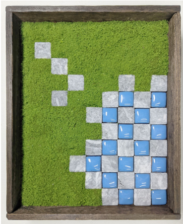
Okamoto Mitsuhiro DOZAemon

15 cloisonne pieces, fake moss, 24 stone pieces hced.16/69 2022 Ref. Tofuku-ji, Hasso garden