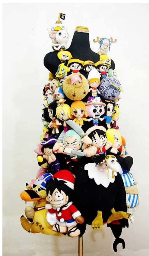
One Piece One Piece, 2016

The art catalogue "69" includes 69 artworks with color images and introductions. 69 artworks are selected by the artist himself. Okamoto has been held his exhibition in Japan, USA, India, Germany, UK, Spain, France, Taiwan and etc. The artist created over 2,000 artworks of paintings, sculptures, installations and art projects. Text by Takeshi Kudo,